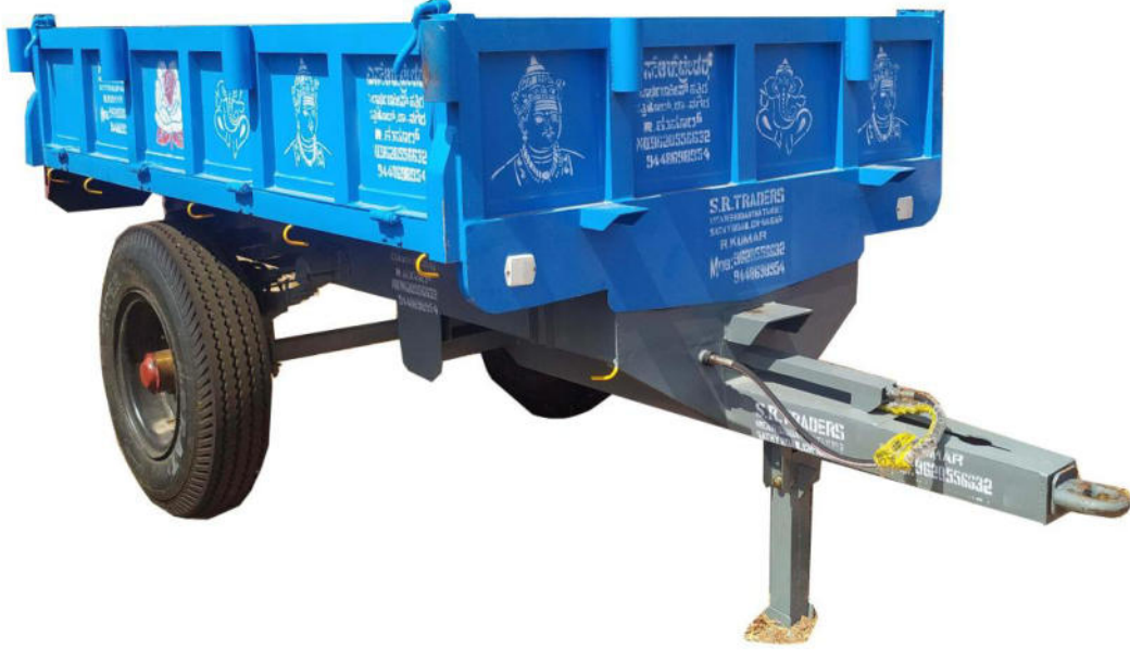
S.R. TRADERS SRT 5 TON TIPPING TRACTOR TRAILER

संख्या/No: T-54/1142 माह/Month: April, 2020 Validity: 31.03.2027