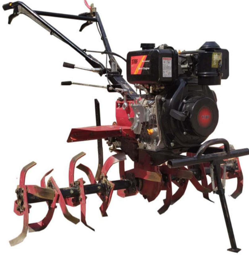
MHASWADKAR BAM 105 POWER WEEDER