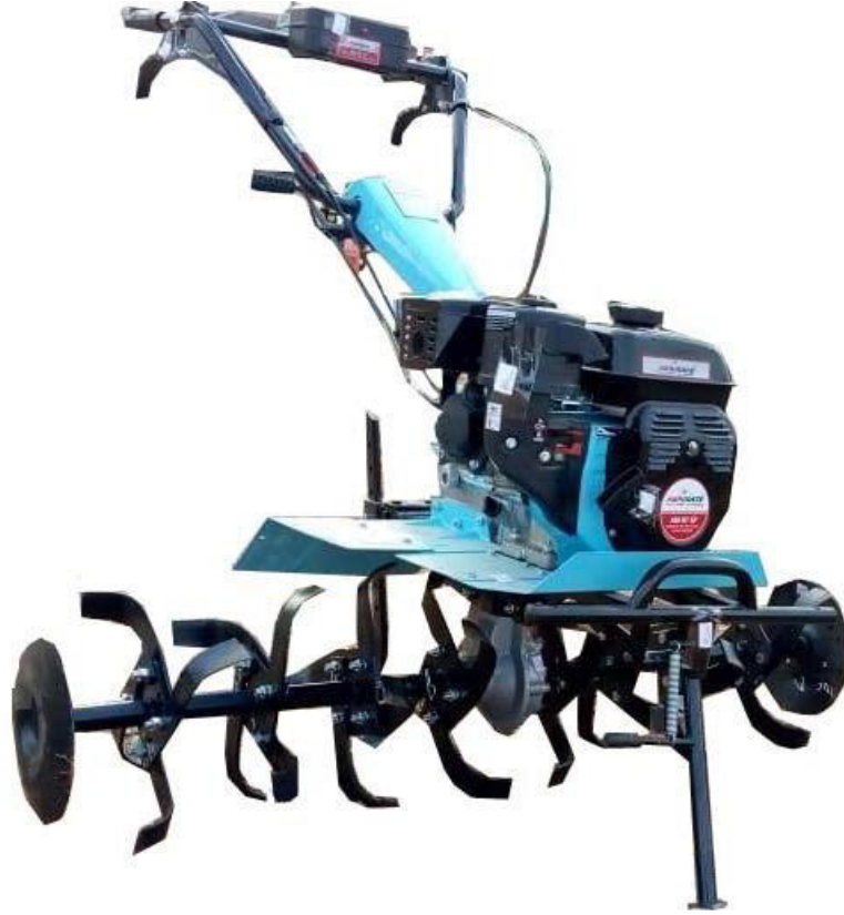
AGRIMATE AM-RT-5P POWER WEEDER