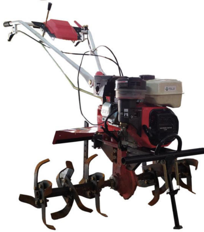
S RAJA R-101 POWER WEEDER