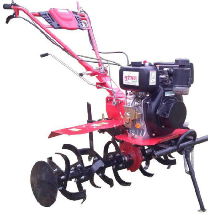
SURANJAN AGENCIES SAT- 105 D POWER WEEDER

संख्याNo: Machine-382/1210 माहMonth: October, 2020 Validity: 30.09.2025