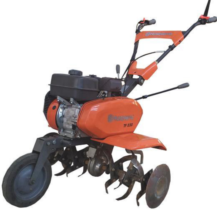
HUSQVARNA TF 230 POWER WEEDER