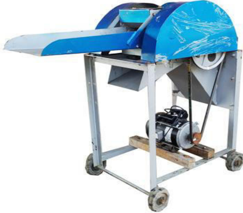
S.R. AGROTECH 2HP CC CHAFF CUTTER [(Power Operated (Electric Motor))]

संख्या/No: Machine-406/1238 माह/रुधMonth: December, 2020 Validity: 30.11.2027