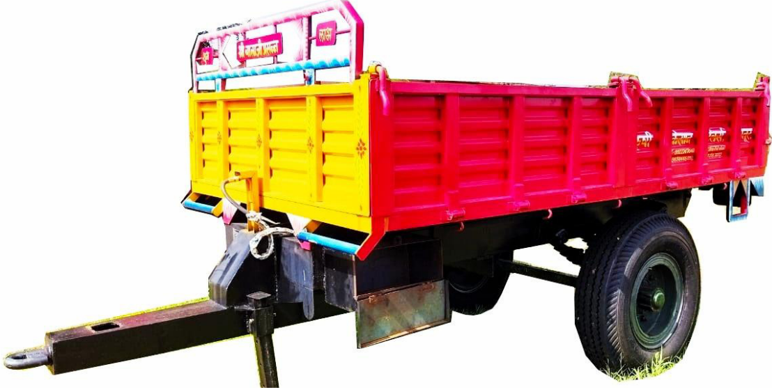
KRUSHI KISAN TRAILORS KKT 5 TOT TRACTOR TRAILER