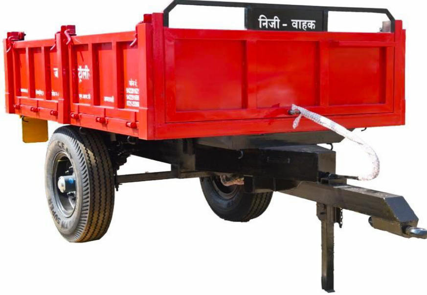
JAI JADHAO 5 TONNE TRACTOR TRAILER