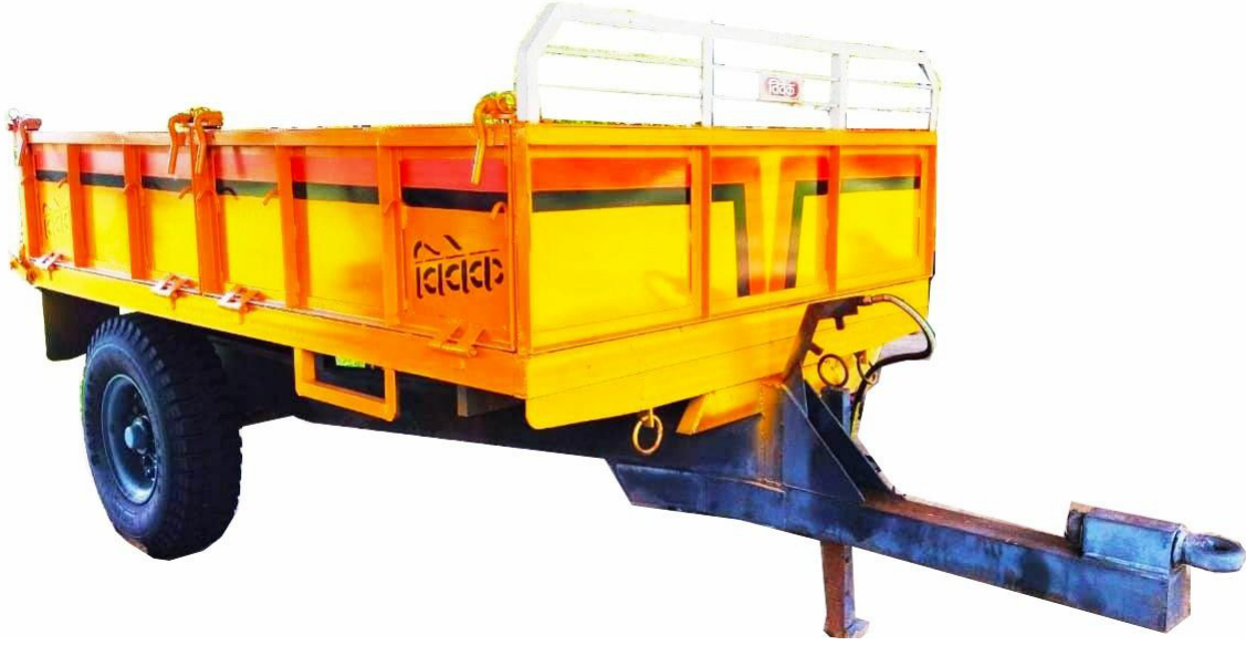
VIVEK ENGINEERING WORKS VEW 5TN TRACTOR TRAILER

संख्याधNo: T-102/1422 माहधMonth: September, 2022 Validity : 31.08.2029