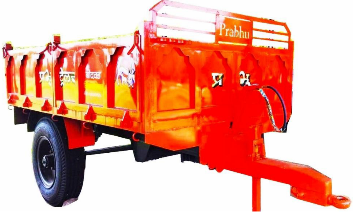
PRABHU PT 5 TON TRACTOR TRAILER