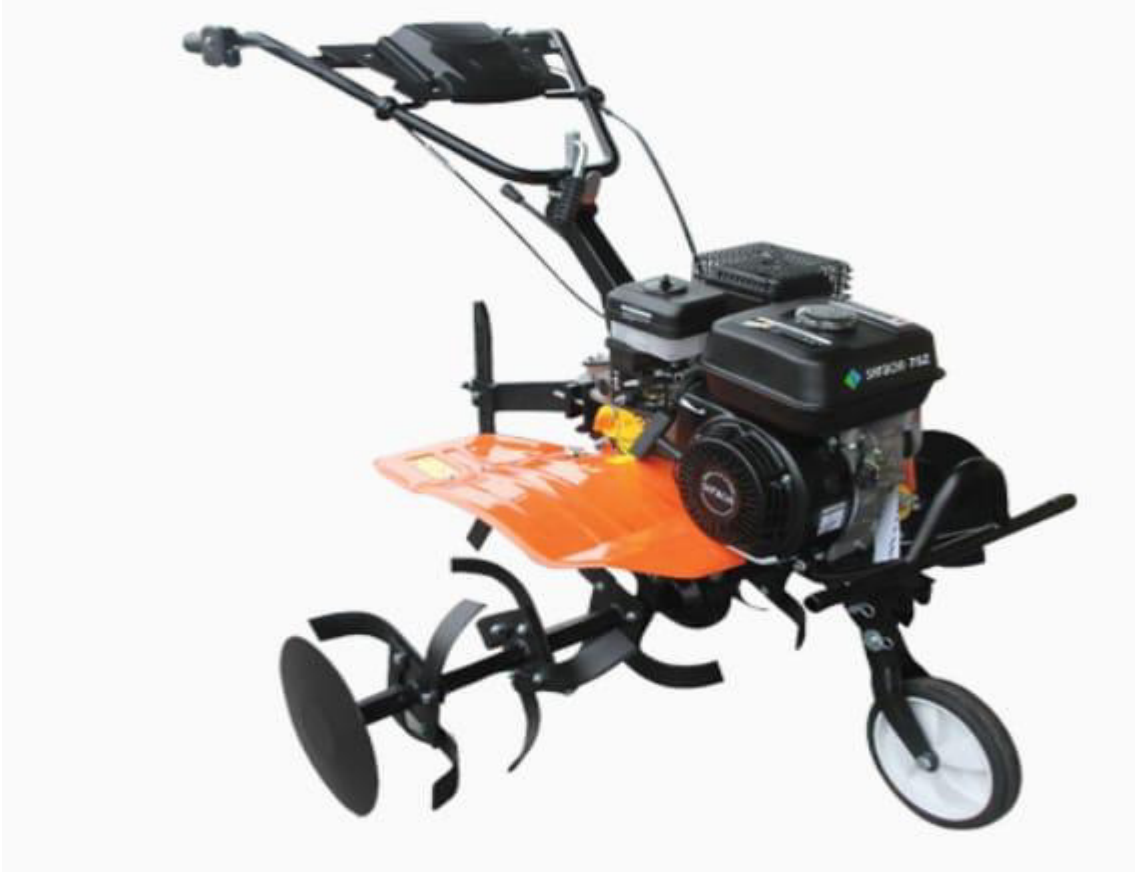
SHRACHI 7P3B POWER WEEDER