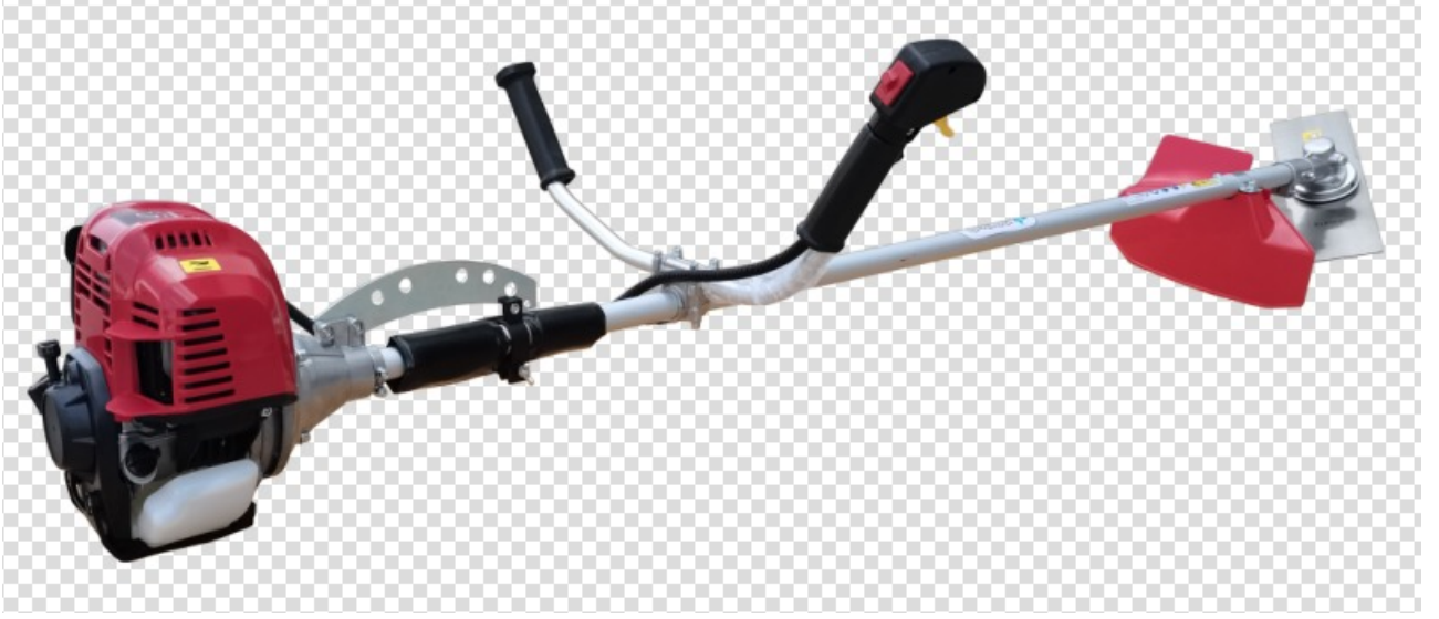
TRISPAN TBC-50 BRUSH CUTTER