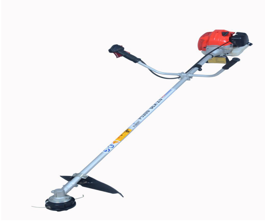
BRUSH CUTTER PUBERT P520S DLX

संख्याNo: Machine-465/1452 माहMonth: December, 2022 Validity: 30.11.2027