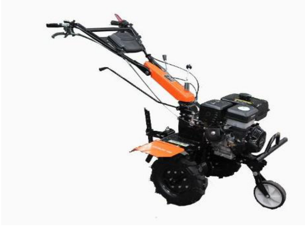
POWER WEEDER SHRACHI 9P3