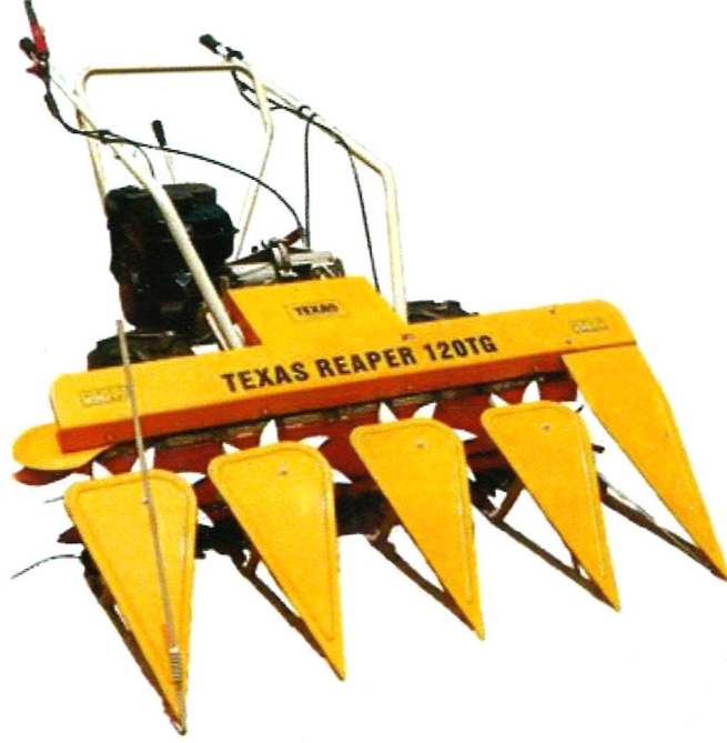
TEXAS 120 TG POWER REAPER

संख्याNo: Machine-474/1474 माहMonth: January, 2023 Validity: 31.12.2027