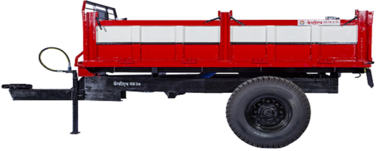
TRACTOR TRAILER KVH AGRO TECH KVHTR3TH TIPPING

संख्याNo: T-122/1476 माहMonth: February, 2023 Validity : 31.01.2030