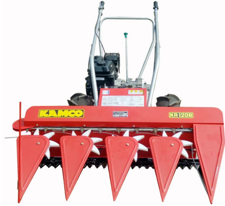
POWER REAPER KAMCO KR-120B

माह: / Month: February, 2023 THIS TEST REPORT IS VALID UPTO 31/01/2028