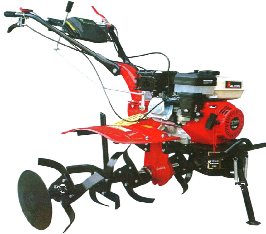
POWER WEEDER VARSHA FALCON