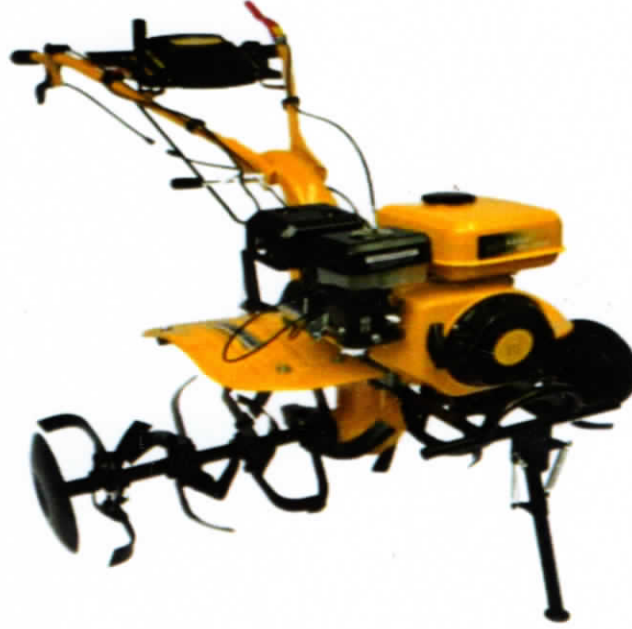
POWER WEEDER VENUS VIS 1000R

संख्याNo: Machine-483/1486 माहMonth: March, 2023 Validity: 28.02.2028