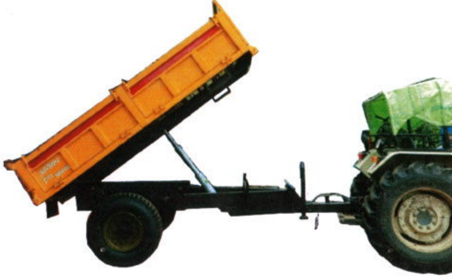
AJINKYA SAI 5 TN TRAILER

THIS TEST REPORT IS VALID UPTO 31.08.2030