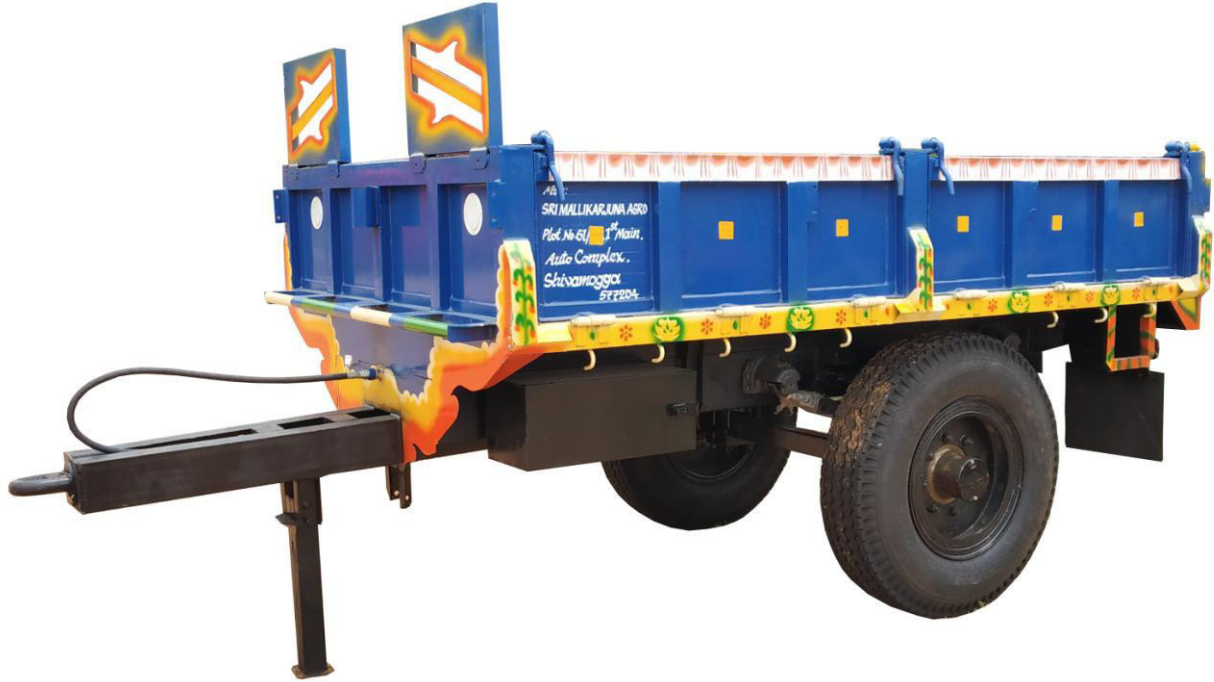
SRI MALLIKARJUNA AGRO SMA-MTT-5 FIVE TONNE TRACTOR TRAILER

संख्या/No: T-23/1038 माह/Month: July, 2019 Validity: 30.06.2026