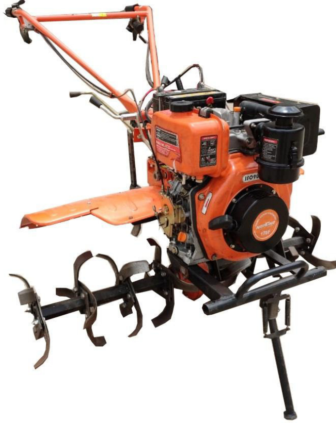
NEPTUNE NWD - 178F POWER WEEDER