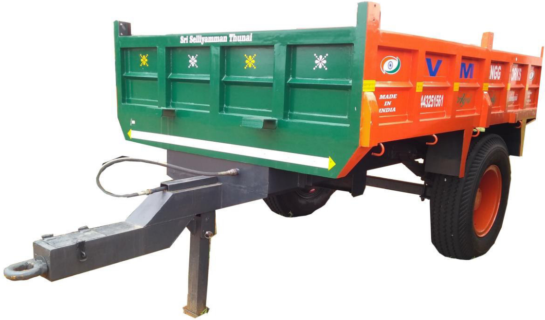
V. M. ENGINEERING WORKS VME - 5 TON FIVE TONNE TIPPING TRACTOR TRAILER