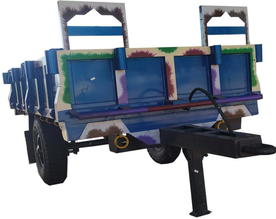
OM GANESH AGRO INDUSTRIES OGAI-03T THREE TONNE TIPPING TRACTOR TRAILER

संख्या / No: T-44/1106 माह / Month: January, 2020 Validity: 31.12.2026