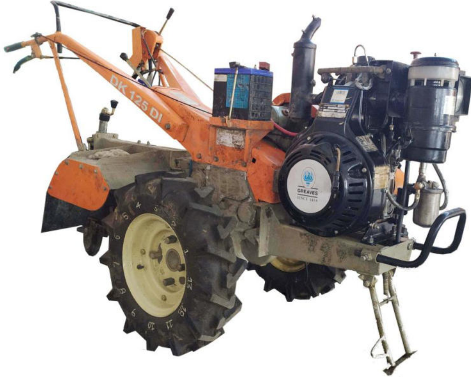
D.K. DIESELS PVT LTD DK 125 DI POWER TILLER

संख्या / No: PT-134/1110 माह / Month: January, 2020 Validity: 31.12.2022