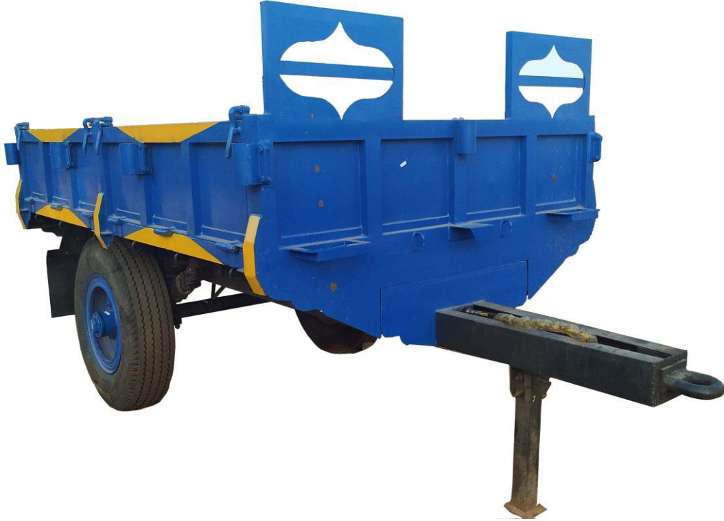
BT ENGINEERING WORKS BT 5 TT FIVE TONNE TRACTOR TRAILER

संख्या/No: T-47/1116 माह/Month: January, 2020 Validity: 31.12.2026