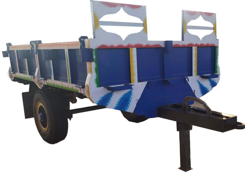
BT ENGINEERING WORKS BT 3 TT THREE TONNE TRACTOR TRAILER

संख्या/No: T-48/1117 माह/Month: January, 2020 Validity: 31.12.2026