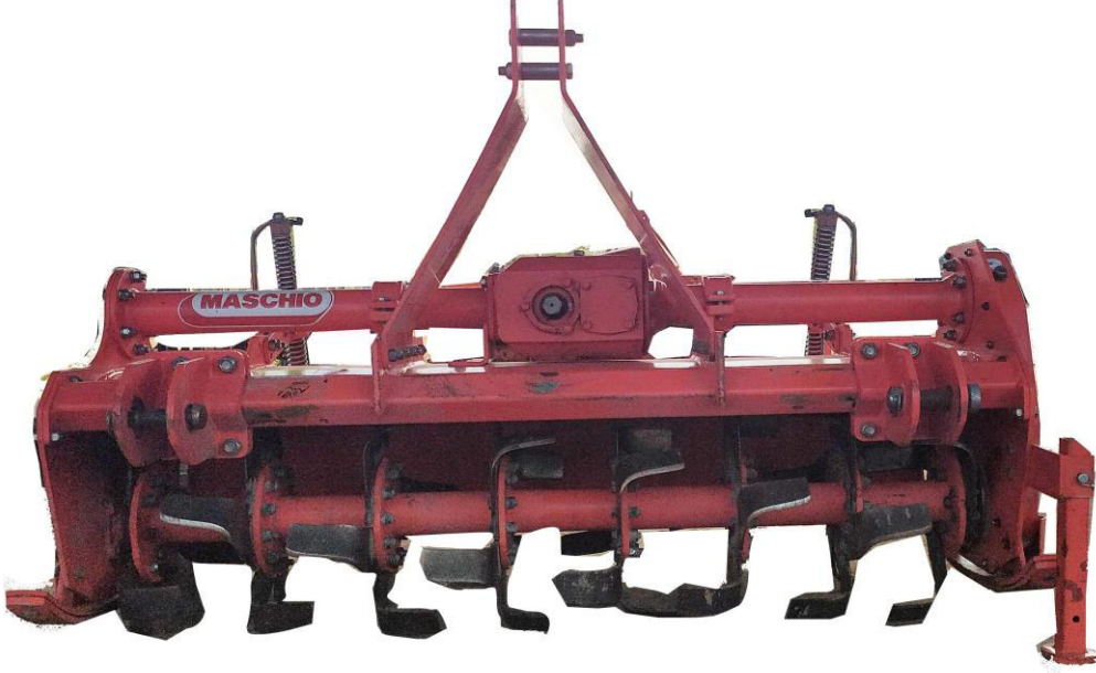
MASCHIO GASPARD0 VIRAT LIGHT 145 ROTAVATOR (Tractor Mounted, PTO Operated)