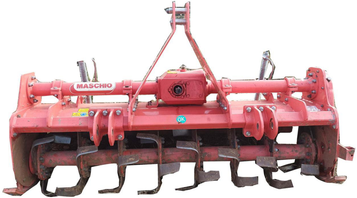
MASCHIO GASPARD0 VIRAT SP 165 ROTAVATOR (Tractor Mounted, PTO Operated)