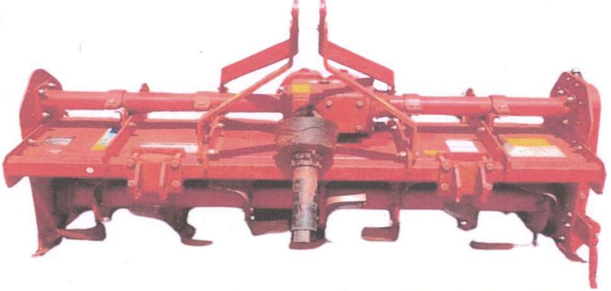
SWARAJ, DURAVATOR SLX PLUS HD 1.7M ROTAVATOR

THIS TEST REPORT IS VALID UPTO 30.04.2031