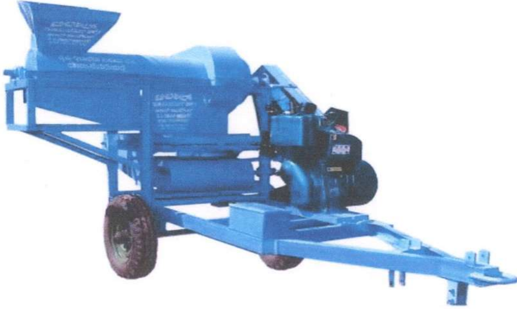
BILAL, BEWDAVANGERE 16x48 MULTI CROP THRESHER (ENGINE OPERATED)

THIS TEST REPORT IS VALID UPTO 30.04.2033